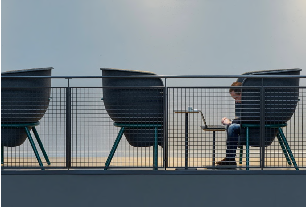
▲ Tele-2 Interior design by Strategisk Arkitektur