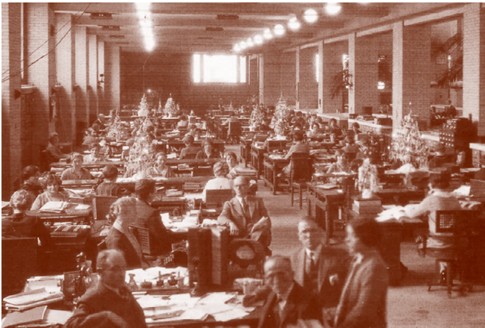
▲ Inside the Larkin Administration Building .

Today, the office can exist anywhere, as long as there is WiFi, a seat and coffee. Remarkable really, when not that long ago offices resembled factories. Rows and rows of desks and no personal space supposedly because this maximized efficiency. In stark contrast, the focus in the office today is shifting towards the individual. Productivity and efficiency are still important but so is creativity and wellbeing. But what is an office and where did the history of the office begin?