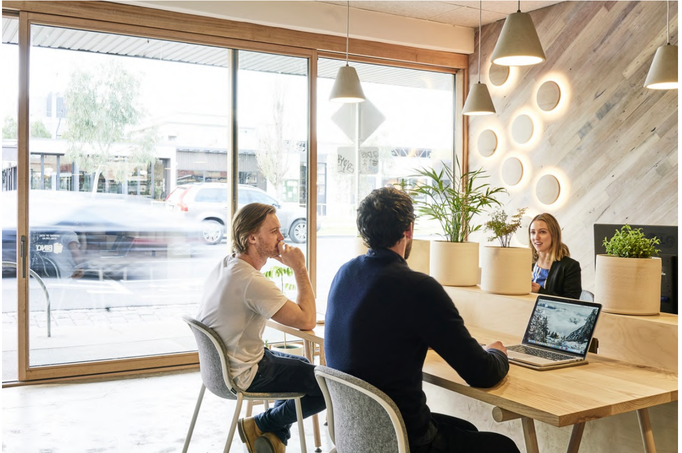
▲ 330 Park Collective Interior design by Archier

Extraverted workers are known to be more sensitive to visual distractions. As they often perform best in an open workspace, it's recommended to design this space in an inspiring but somewhat neutral way.