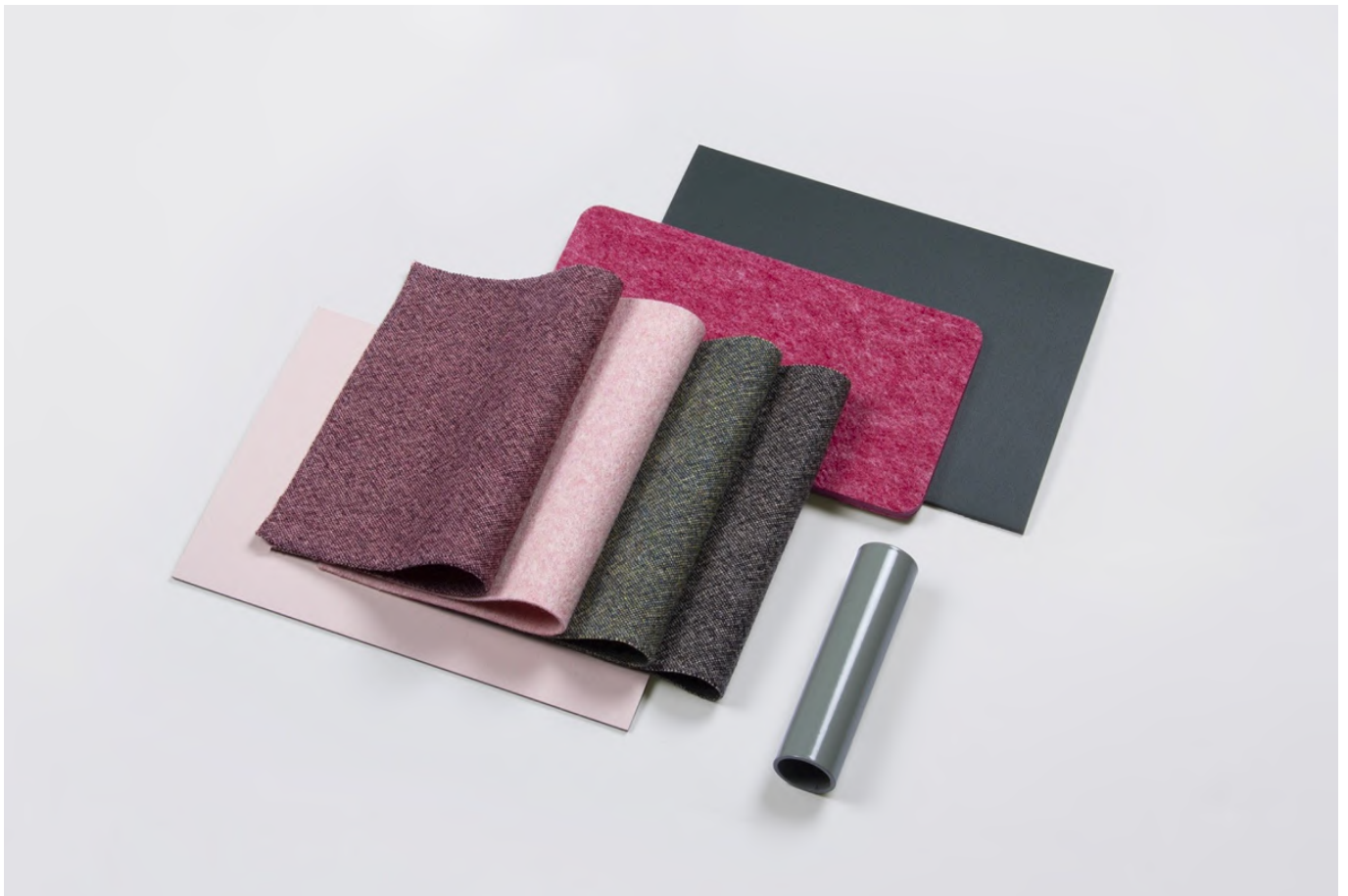
▲ De Vorm's Pink PET Felt combined with green tones by Kvadrat & Forbo.

If you are designing a new workplace, it would be interesting to keep Angela Wright's research in mind. Define which personalities will be using the space and adjust your colour scheme accordingly. Creating a fit-for-all interior poses a challenge for employers and architects. The ultimate goal is a universal design with maximum flexibility, that can be tailored to individual preferences. Workplace aesthetics should not compromise its comfort — and colour choice is no exception here.