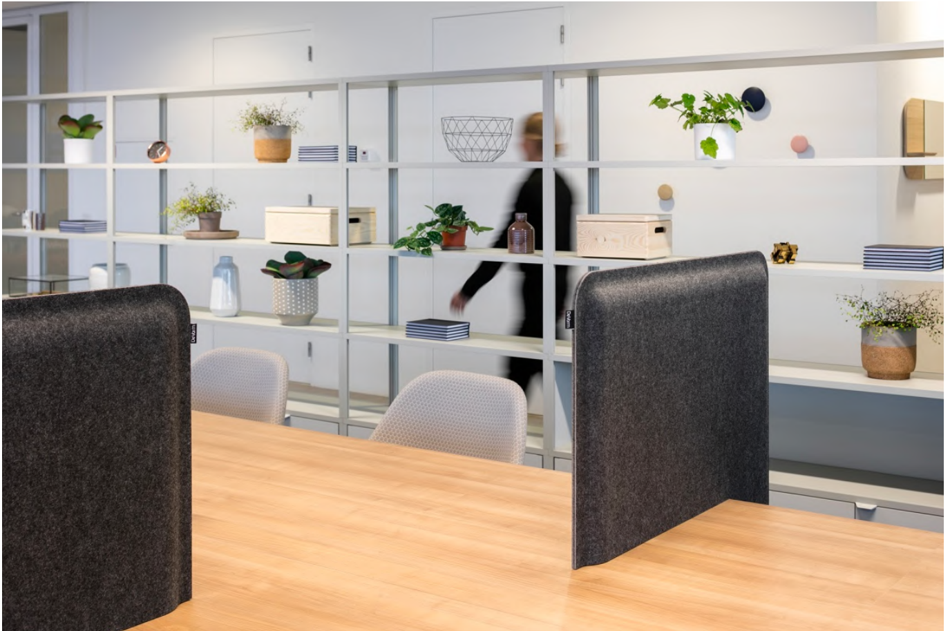
▲ UN Studio Office Tower Interior design by VOID Interieurarchitectuur

Even though the modern workplace is built around the paradigm of collaboration, it needs space for solitude as well. If people cannot get some alone time to elaborate on ideas, they risk being trapped in a groupthink. Such an environment might eventually kill creativity inside the team. The real magic happens somewhere at the intersection when employees bring their diverse insights together to reach a common goal.