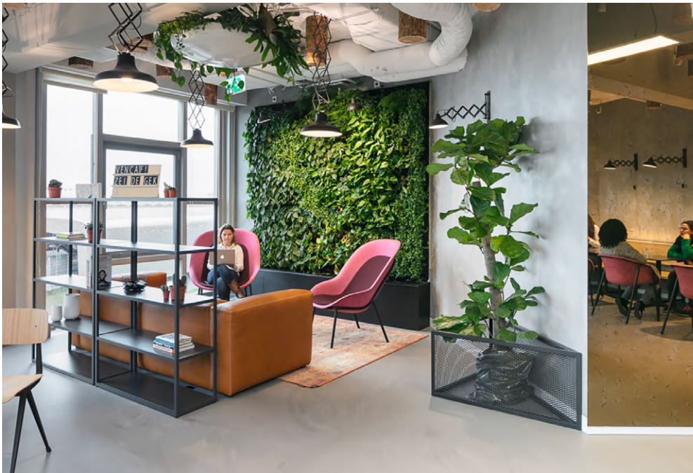
▲ Cambridge Innovation Center , Interior design by Kraaijvanger Architects

Which colour supports productivity? This study concluded that most people find white the least distracting, but is it really so? Their data showed a different pattern — people in white settings made more errors than those working in any other surrounding. So, you might want to reconsider using too much white in a room for detail-oriented tasks, like accounting. In fact, employees made the most mistakes in all the light-coloured offices — such as beige, yellow, and light-grey, when compared to a darker environment.