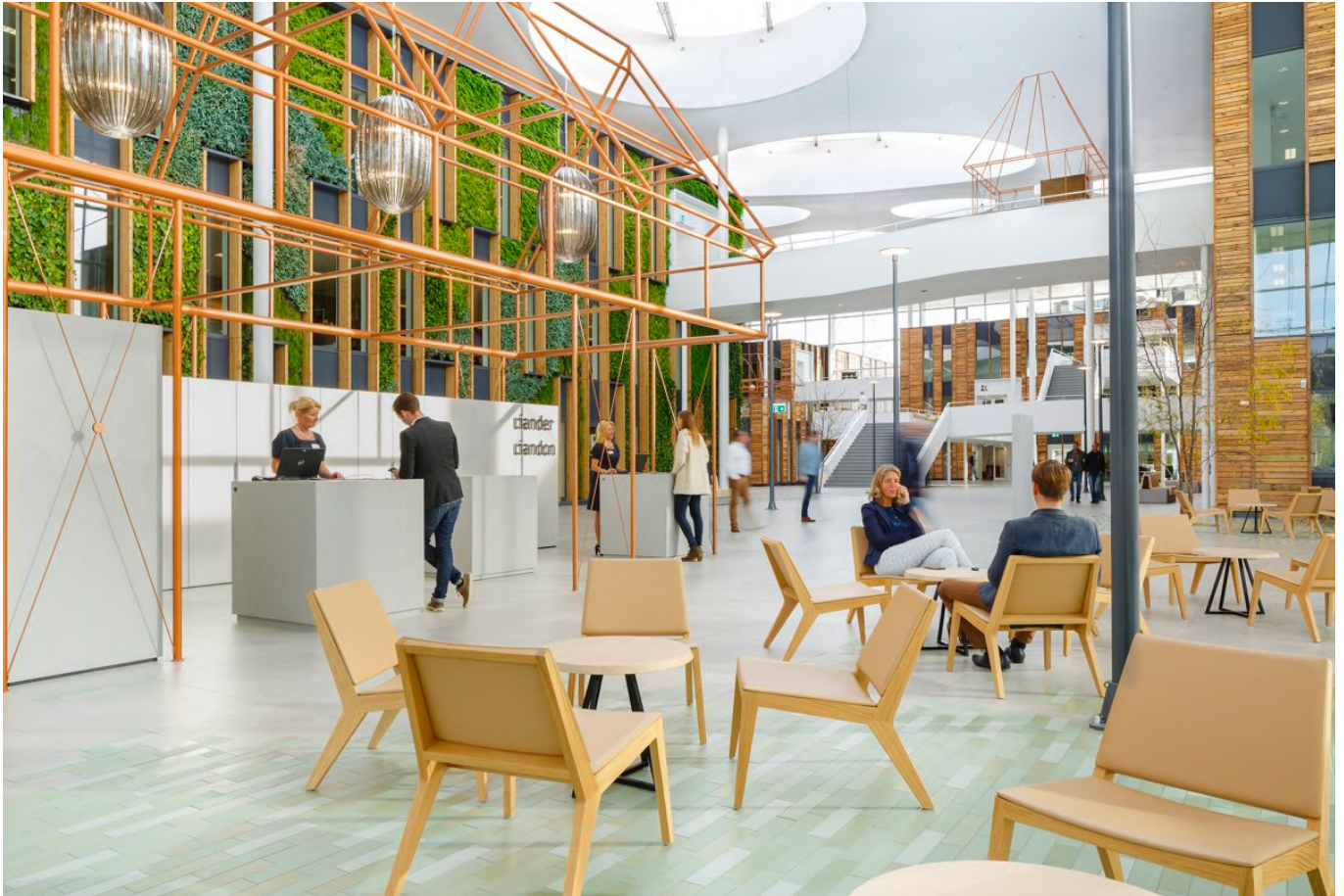
▲ Liander Interior design by RAU architects

Don't limit yourself to the inside area only — an outdoor garden or a rooftop terrace can also be used to create the third place. Up to 86% of workers indicated the desire to work outside, so why not let them? This could have significant long term benefits — studies show that spending a part of the working day outdoors has a positive impact on employees' concentration, creativity and problem-solving.