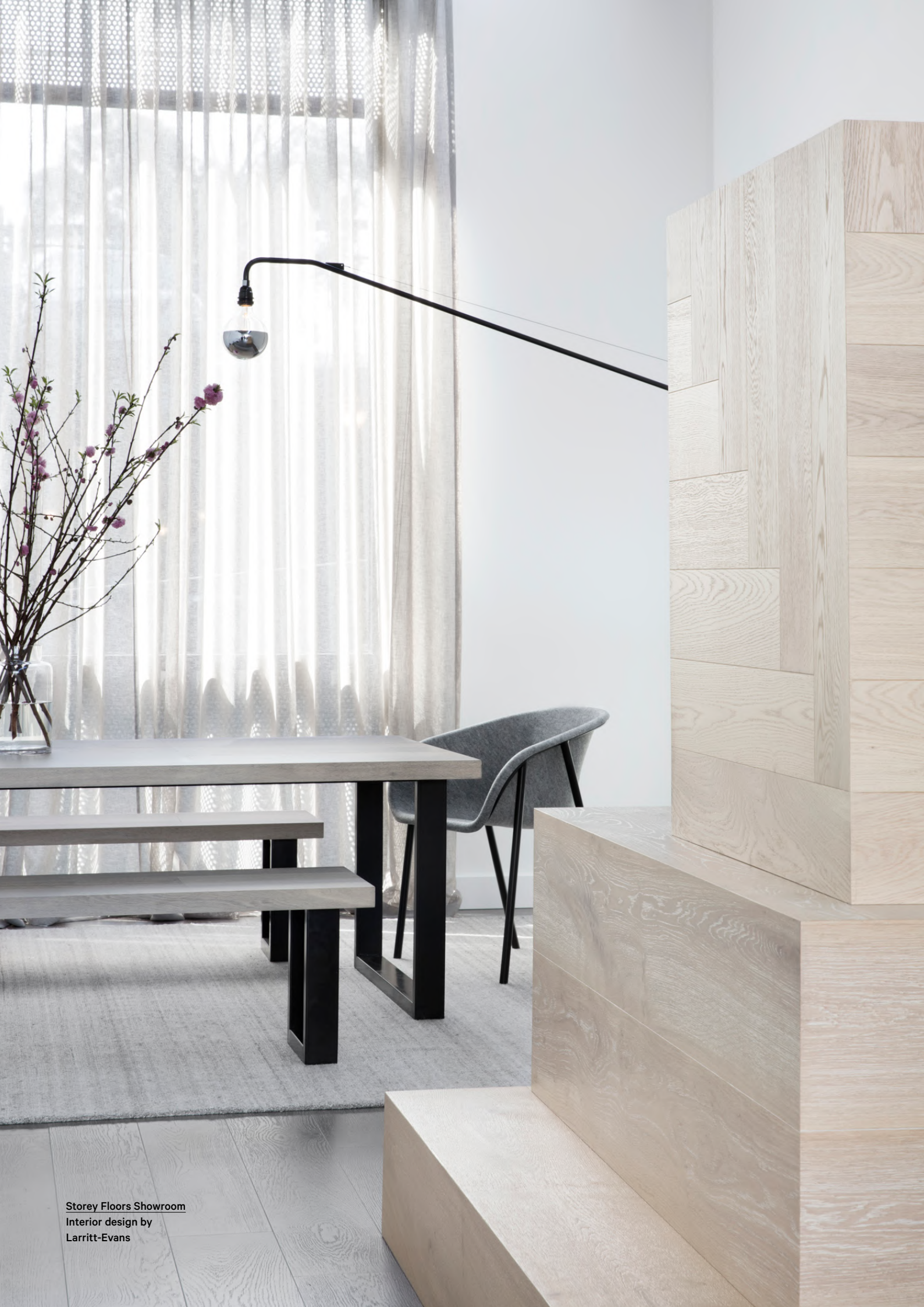
Storey Floors Showroom Interior design by Larritt-Evans