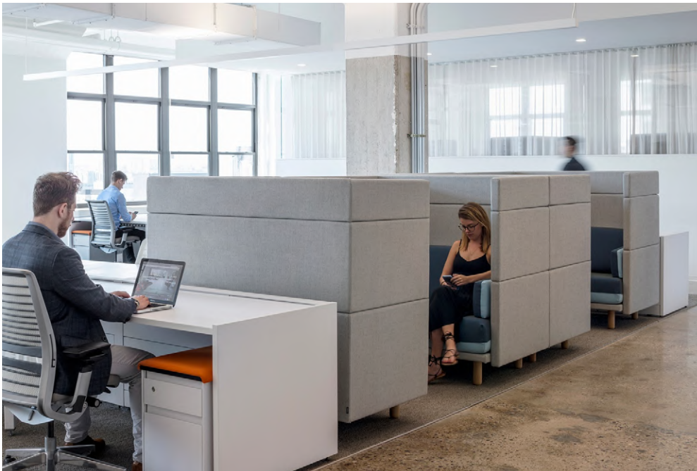
▲ Horizon Media Interior design by A+I

With people spending a third of their life in the office, it becomes more than just a place of work. It's also where we socialize, create and have fun. And it doesn't only happen at our desk. Which is why every office needs breakout areas to serve all our purposes in our everyday work routine.